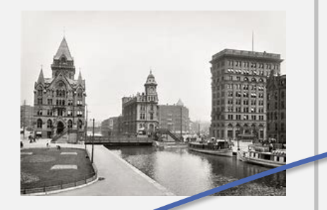
2<sup>nd</sup> Industrial Revolution

Manufacturing fuels the growth of a diverse middle class